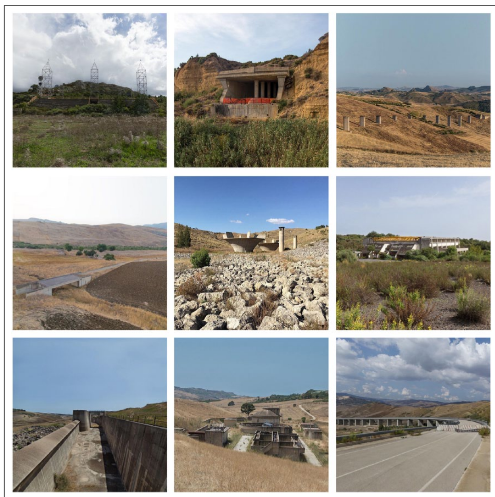
Figure 3. Remote unfinished public works.