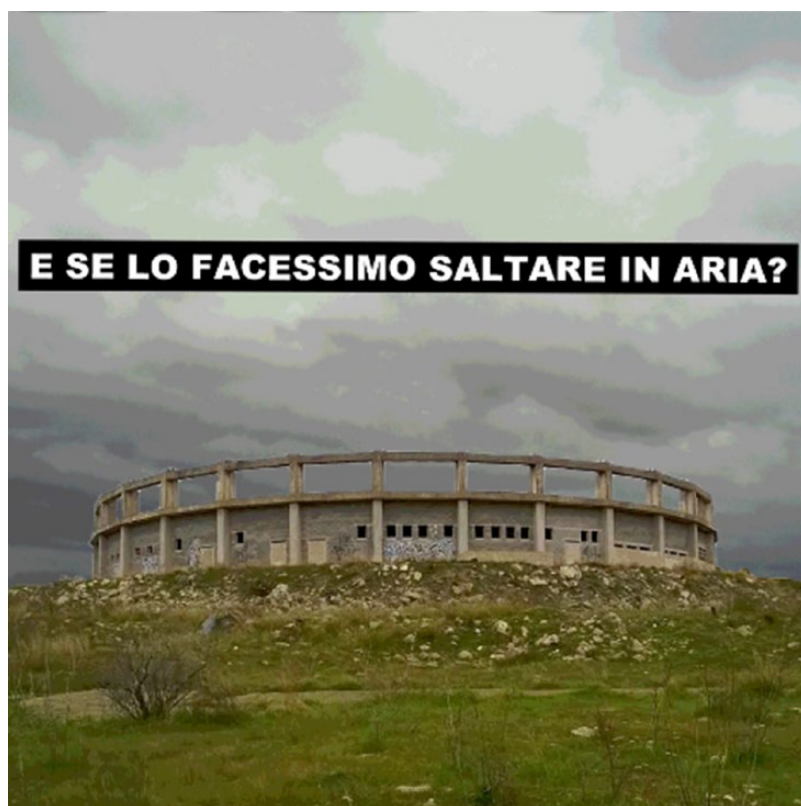
Figure 2. Image announcing Alterazioni Video's workshop at the Ragusa Foto Festival 2016.

Video announced the workshop and a subsequent exhibition as part of the Ragusa Foto Festival 2016 – an event that, since its conception in 2012, receives on average nearly 4,000 visitors during the 4 weeks it takes place 39 – leaves no room for doubt; the idea was clear: ‘What if we blow it up?’ (Figure 2). Masu passionately contextualises the reasons and motivations behind this approach: