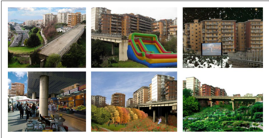
Figure 4. Original Ponte dei Capri on the top-left and its imagined proposals.