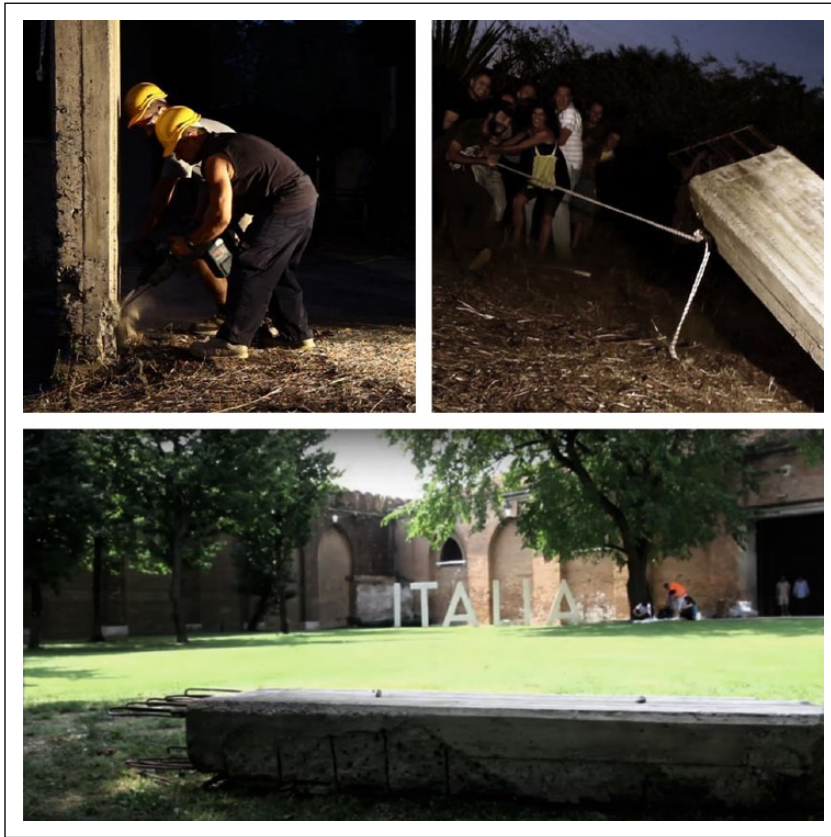
Figure 1. Tearing the column down and then exhibited at the Venice Architecture Biennale.

According to Masu, this performance was very controversial because, originally, certain local politicians were embarrassed by the phenomenon of incompleteness in Giarre and did not want the name of the town to be associated. However, after tough negotiations and explanatory meetings, the local council unanimously approved the action which, once carried out, demonstrated that the partial destruction of a work can breathe new life and consensus into a community. And yet the column, relocated and put on display, suddenly becomes a relic, an object of admiration even if the site from which it originates had been dismembered. The column, exhibited for the whole summer in one of the most important architectural events in the world, stood as a symbol of incompleteness throughout Italy – as a fragment has the potential to represent a whole. 37 The performance similarly illustrates how to exorcise architectural remains when participatory destruction is viewed as a positive operation. Seeing the public, festive atmosphere that occurred in Giarre, 38 it can be said the building was divested of its futile aura and, though destruction may well be associated with oblivion, here it is evident that people were participating in the transformation and reinterpretation of the significance of incompleteness.