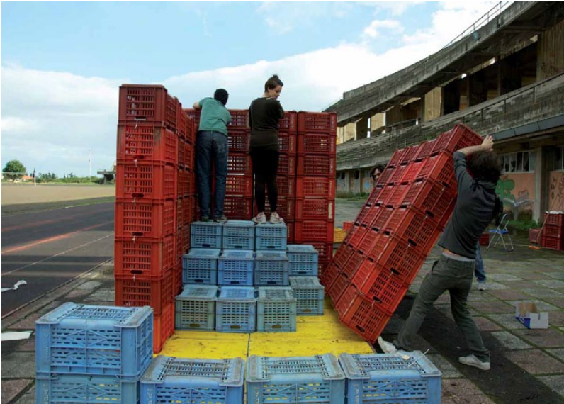
Figure 6. Beyond imagination.